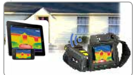
Wi-Fi connectivity with FLIR Tools Mobile app