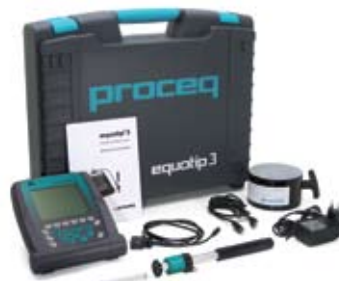
353 10 300 unit G