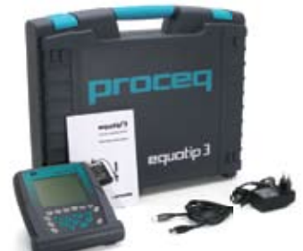
353 10 050 basic unit