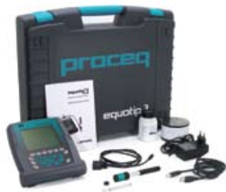
353 10 100 unit D

Equotip3 indicating device, AC adapter, carrying case, USB-cable, USB-memory stick, operating instructions and quick reference guide. The customer needs to buy the appropriate impact device and test block in addition to the Equotip 3 basic unit