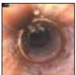
Before Auto Upright