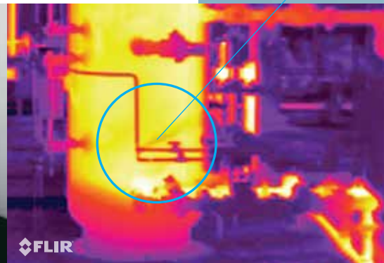
Natural gas emissions