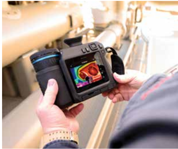
Natural gas fitting leak

Armed with the GF77, you can scan components quickly, focusing on problem areas and finding small leaks you might miss with a traditional TVA or "sniffer." Efficient leak detection and repair (LDAR) will help protect the environment while avoiding product losses and ensuring a safer work environment.