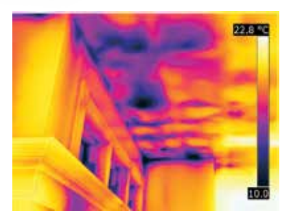
Quickly detect moisture intrusion and building deficiencies