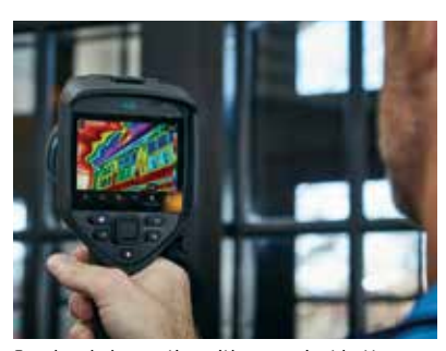
One-handed operation with convenient buttons for safe, streamlined use