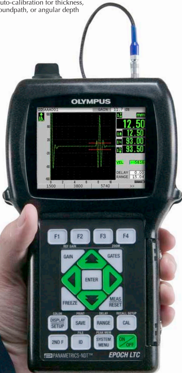
Hand strap can be moved for use with left or right hand

Four custom function keys allow operators to select preset values for instrument configuration parameters.